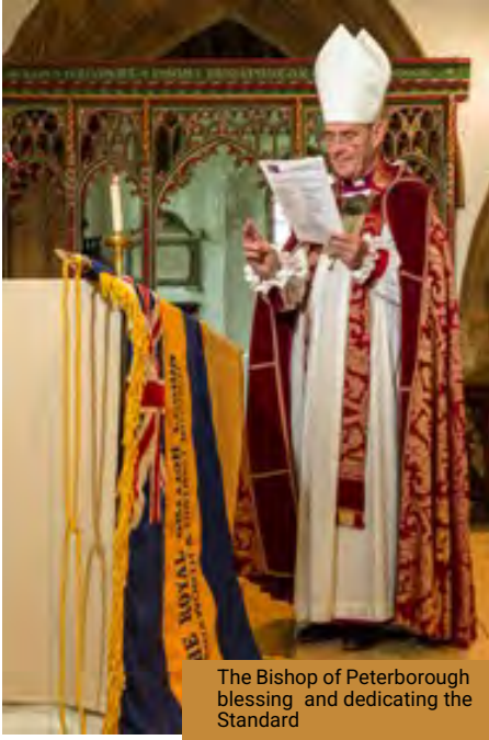
The Bishop of Peterborough blessing and dedicating the Standard

People often ask me , why do you do all this, which branch of the forces did you serve in, and do you need any help? So this is probably a good time to explain a few things.