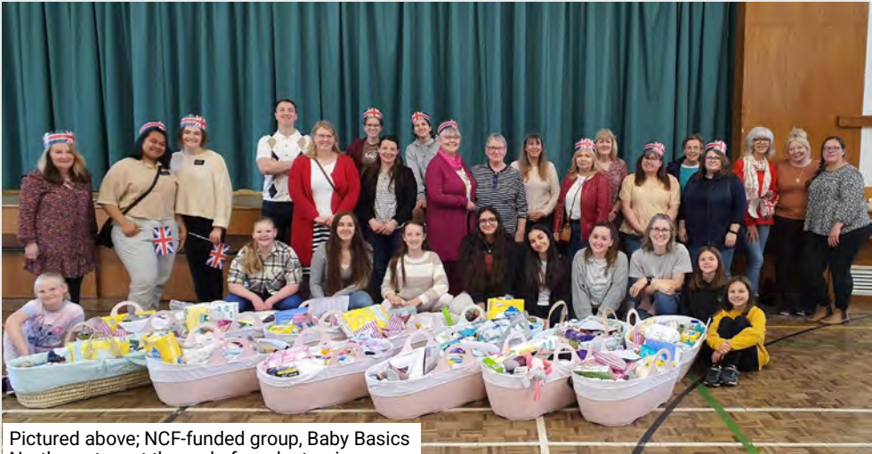
Pictured above; NCF-funded group, Baby Basics Northampton, at the end of a volunteering session put on for The Big Help Out 2023, making Moses basket starter packs for new parents

“We warmly welcome interest from a broad range of people that are passionate about Northamptonshire’s communities and especially candidates with expertise or experience in the